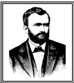
Ulysses S. Grant